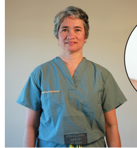
2. Perform hand hygiene.