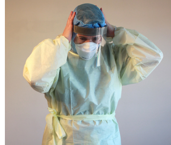
8. Place face shield on, and adjust to fit.