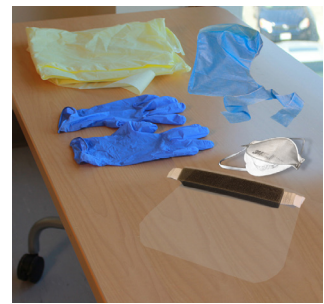
1. Gather PPE: gown, gloves, hood with ties, N95 mask and face shield.

Current PPE recommendations for COVID-19 or suspected COVID-19 patients.