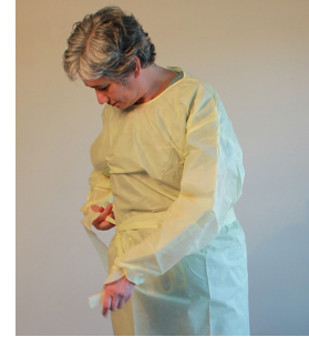
4. Secure gown at waist with side ties.