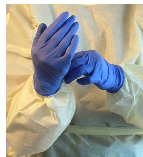
11. Put on gloves, securing them over the wrists of the gown.