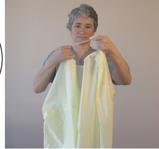
3. Put on gown, pulling the neck strap over your head.