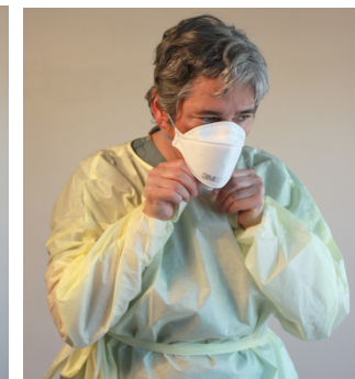
6. Place the N95 mask over your face, placing the elastic bands at the middle of the head and neck. See How to Properly Put on and Take off a Disposable Respirator (right), for more information.