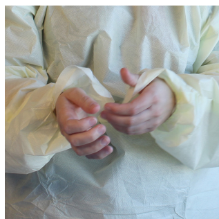
10. Secure gown sleeves by putting thumbs through the thumb loops.