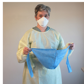
7. Place hood on head, cross ties at front to cover neck, tie in the back, ensuring ears and hair are covered.