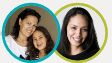
Caring for others