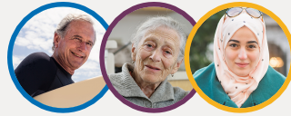
Long term condition