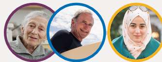
Caring for self