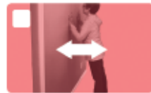
Wall push up