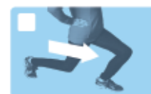
Single leg lunge