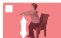
Sit down-stand up

Here are some strength training exercises you can use when first starting your strength training routine. Choose 2-3 of these exercises to start with and then add another 1-2 more once those become easy. Check which ones you are going to do.