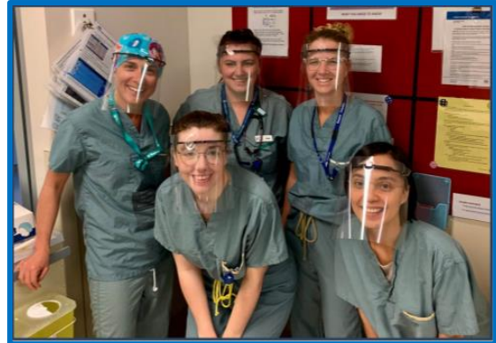
Island Health New Graduate Nurses

Submit your Provisional Licence Application as soon as instructed to do so by your school. Late applications can delay start dates.