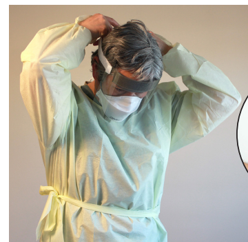
7. Place face shield (or goggles) on, and adjust to fit.