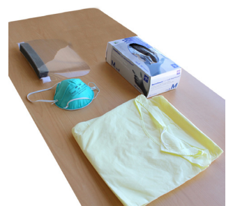
1. Gather PPE: gown, gloves, N95 mask and eye protection.