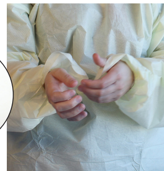
9. Secure gown sleeves by putting thumbs through the thumb loops.