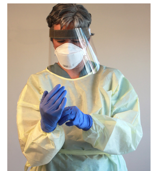
10. Put on gloves, securing them over the wrists of the gown.