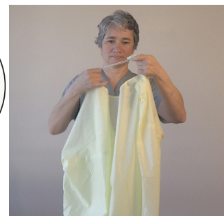
3. Put on gown, pulling the neck strap over your head.