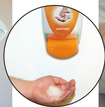
8. Perform hand hygiene.