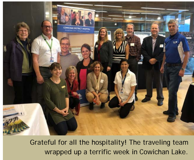
Grateful for all the hospitality! The traveling team wrapped up a terrific week in Cowichan Lake.